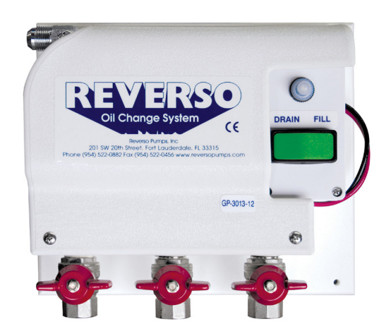
3 Valves Manifold System