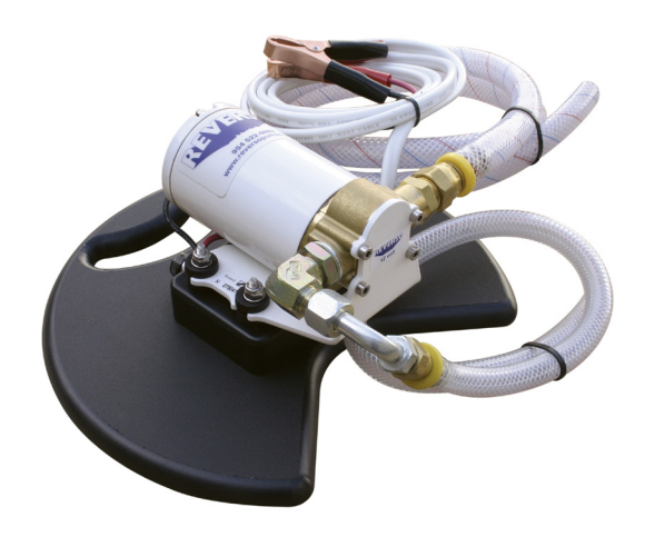
Portable System with Gear Pump for Bucket