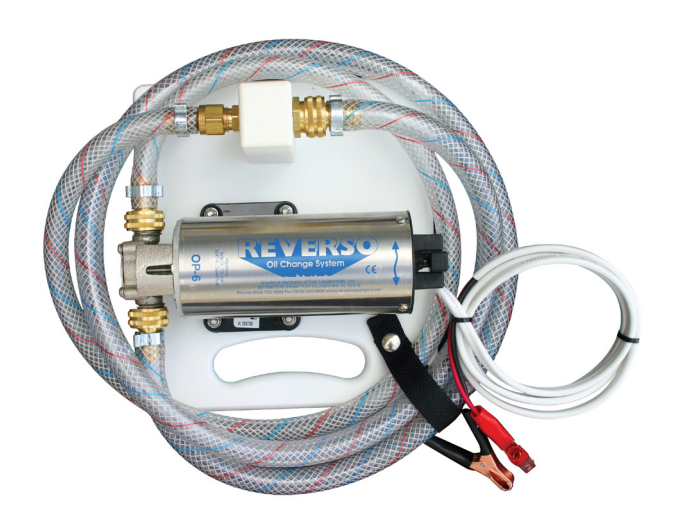
Portable System with Impeller Pump